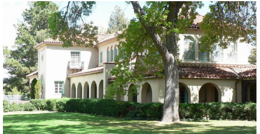
The Villa Philmonte, at Philmont, was Waite Phillips' summer home. It is located across the road from Camping Headquarters. Have your Ranger help schedule a tour and earn the Villa patch while you are in Base Camp.

Search: Having trouble finding information on a particular topic? You can search for it by keyword(s).