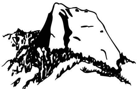
The Tooth of Time