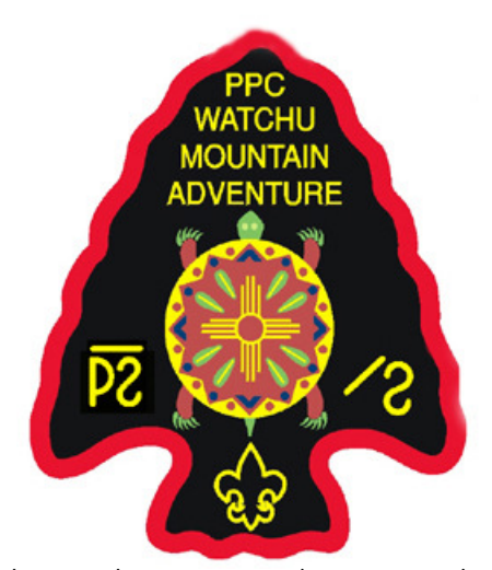
The Watchu Mountain Adventure patch is awarded to all crew members who attend and complete the training weekend in May

This guide was developed by the Patriots' Path High Adventure Committee to support our contingent crew advisors in preparing their crews for Philmont treks.