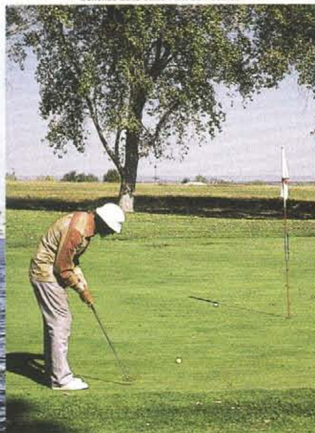
Conchas Lake State Park Golf Course