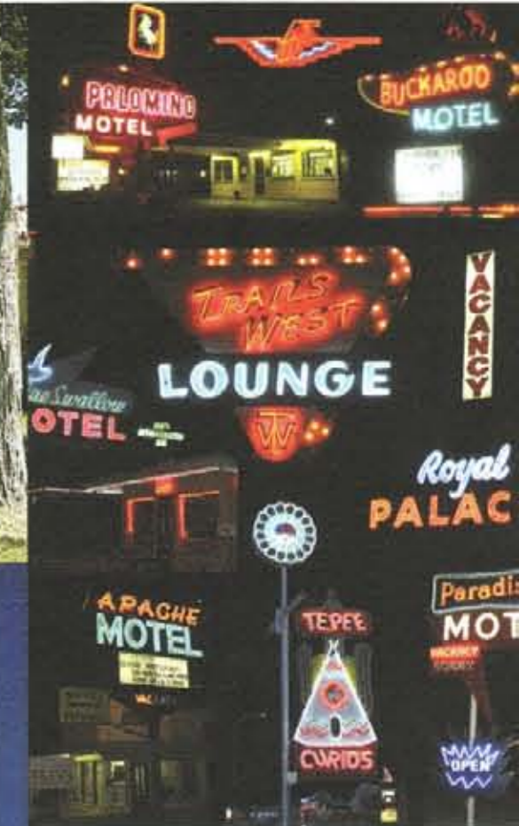
Tucumcari Neon