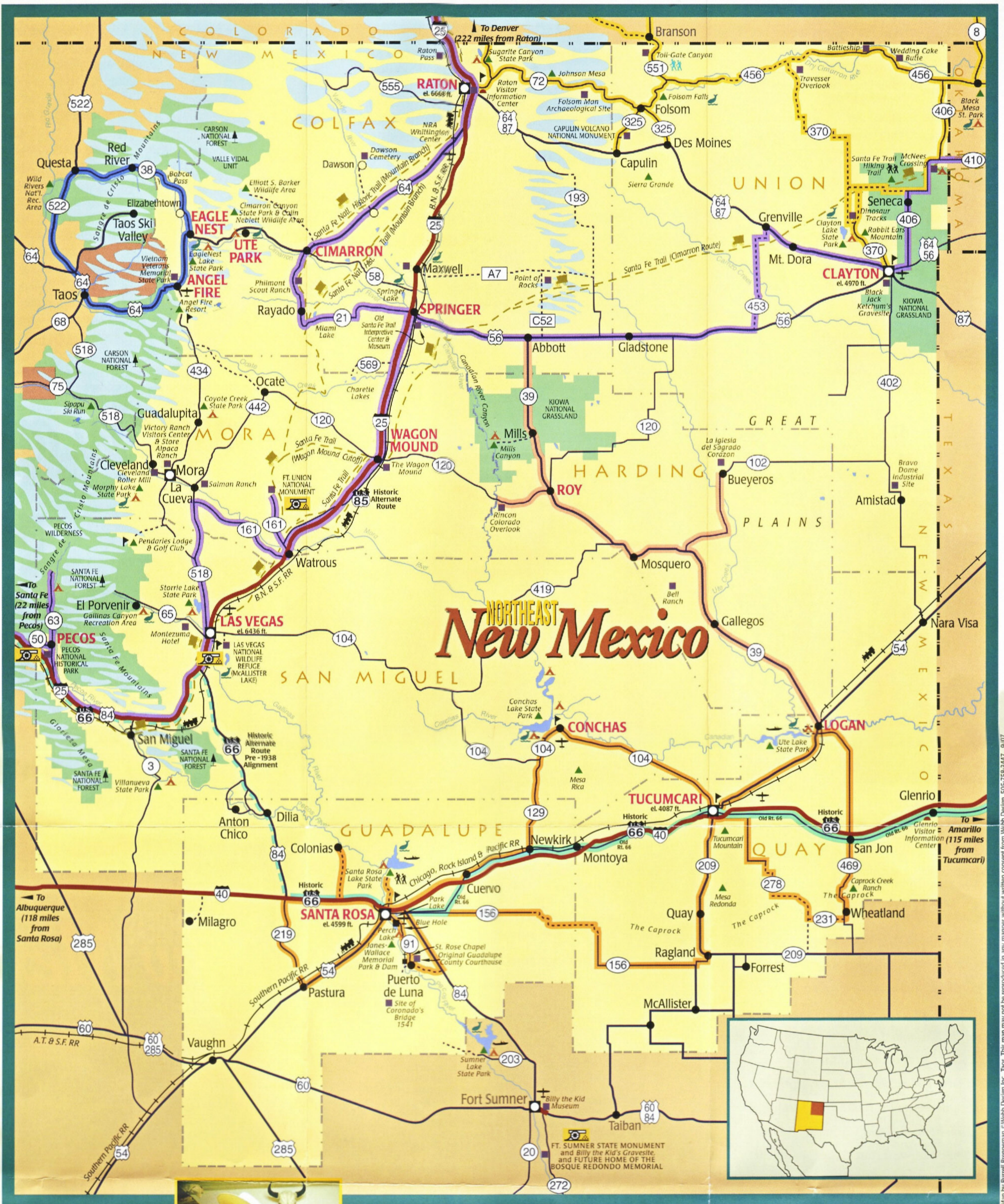
This map may not be reproduced in any manner without written consent from Webb Design. 505-758-3447 9/07