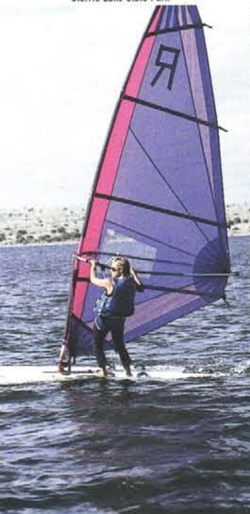
Storrie Lake State Park