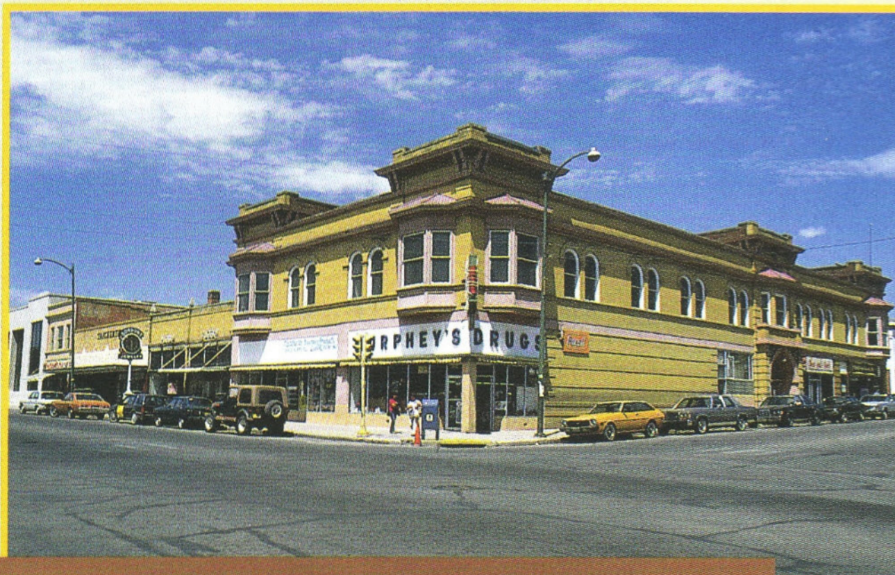
Crockett Block (Murphey's Drug Store), Las Vegas

Listen carefully and you can hear the eagles and hawks screech as they fly. The winds bring the whisper of Folsom Man's spears flying through the air, the clip-clop of horses carrying Spanish conquistadores , the woody creaks of wagons following the Santa Fe Trail. Listen for the mournful wails of distant railroad whistles and the thrum of '56 Chevys on Route 66. Now get out of your car and stay awhile. Be a part of history being made today.