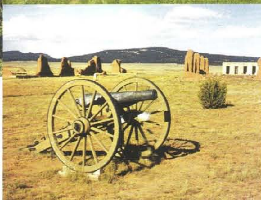
Fort Union National Monument