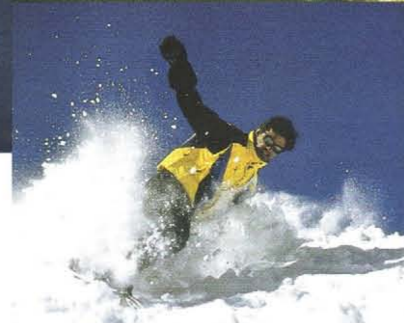
Angel Fire Resort