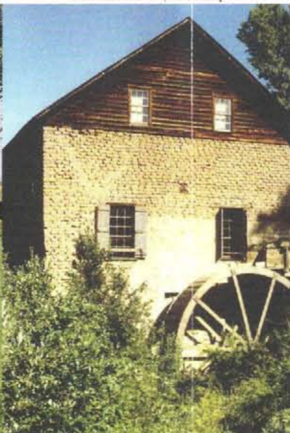
Cleveland Roller Mill, Mora County