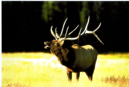
Elk in the Valle Vidal

In addition to excellent fishing along the scenic Cimarron River , nine miles of which are a premier Wild Brown Trout fishery, Cimarron Canyon State Park hosts other recreational activities. The nearby Maxwell Wildlife Refuge is composed of 2,800 acres of grassland, lakes, and agricultural land that feature excellent migratory waterfowl viewing and other wildlife observation and photographic opportunities. The E. S. (Elliot) Barker Wildlife Area offers similar attractions in a truly primitive setting. Contact the Cimarron Chamber of Commerce or visit their website for more information on these unique wilderness areas.