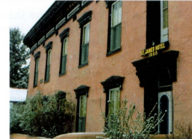
St. James Hotel, National Historic Landmark

Stroll through art studios and galleries, watch a skilled hand-weaver in action, order a custom saddle or tour a candle factory. Cimarron boasts a variety of wares including historical clothing, pottery and ceramics, leatherwork, jewelry, weaving, paintings, photographs, woodwork, folk art and candles. Our schools also offer a community greenhouse displaying a variety of native plants and flowers.