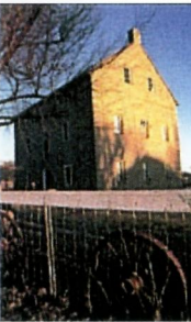
The Old Mill Museum