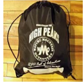
WMO SLING DAYPACK $7.00