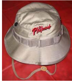
WMO 'BOONEY'- STYLE HAT $25.00