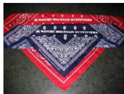
WMO BANDANA $3.00