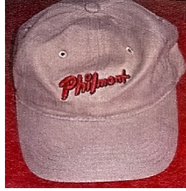
WMO PHILMONT BASEBALL CAP $15.00