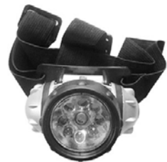
WMO HEADLAMP $15.00

Go to the Watchu Mountain Outfitters online Trading Post (or use the Quick Link) for additional information, to see other available items, and to download an Order Form .