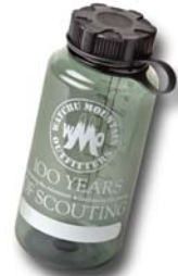
WMO WATER BOTTLE $10.00