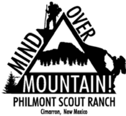
WMO BACKCOUNTRY/ RAFTING T-SHIRT $20.00