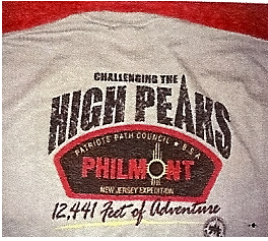
PPC EXPEDITION BASE CAMP T-SHIRT $15.00