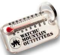
WMO ZIPPER PULL THERMOMETER $2.00