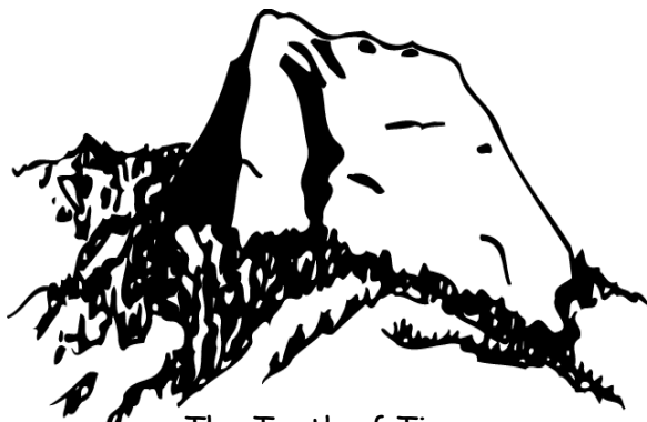
The Tooth of Time